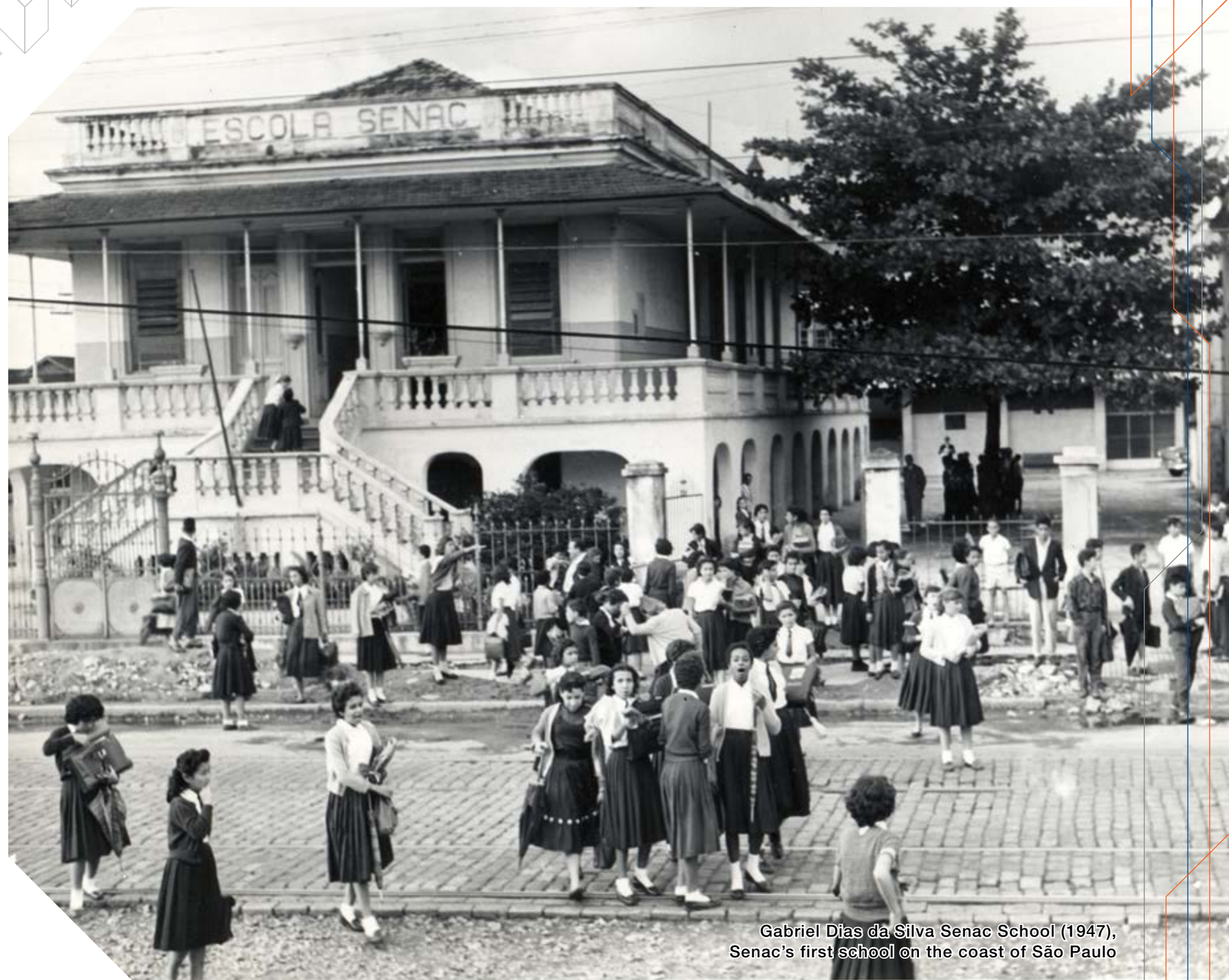
Gabriel Dias da Silva Senac School (1947), Senac's first school on the coast of São Paulo

Senac was created on January 10, 1946 by Decree Laws 8,621 and 8,622, which authorized the National Confederation of Commerce to set up and administer schools of commercial training throughout Brazil. Then, the National Service for Commercial Education (Senac) was born, a non-profit private institution that acts in a decentralized and autonomous way in each of the Brazilian states. The first Regional Board of Senac São Paulo was elected on July 13, 1946 and its Regional Administration began on September 1 of that year.