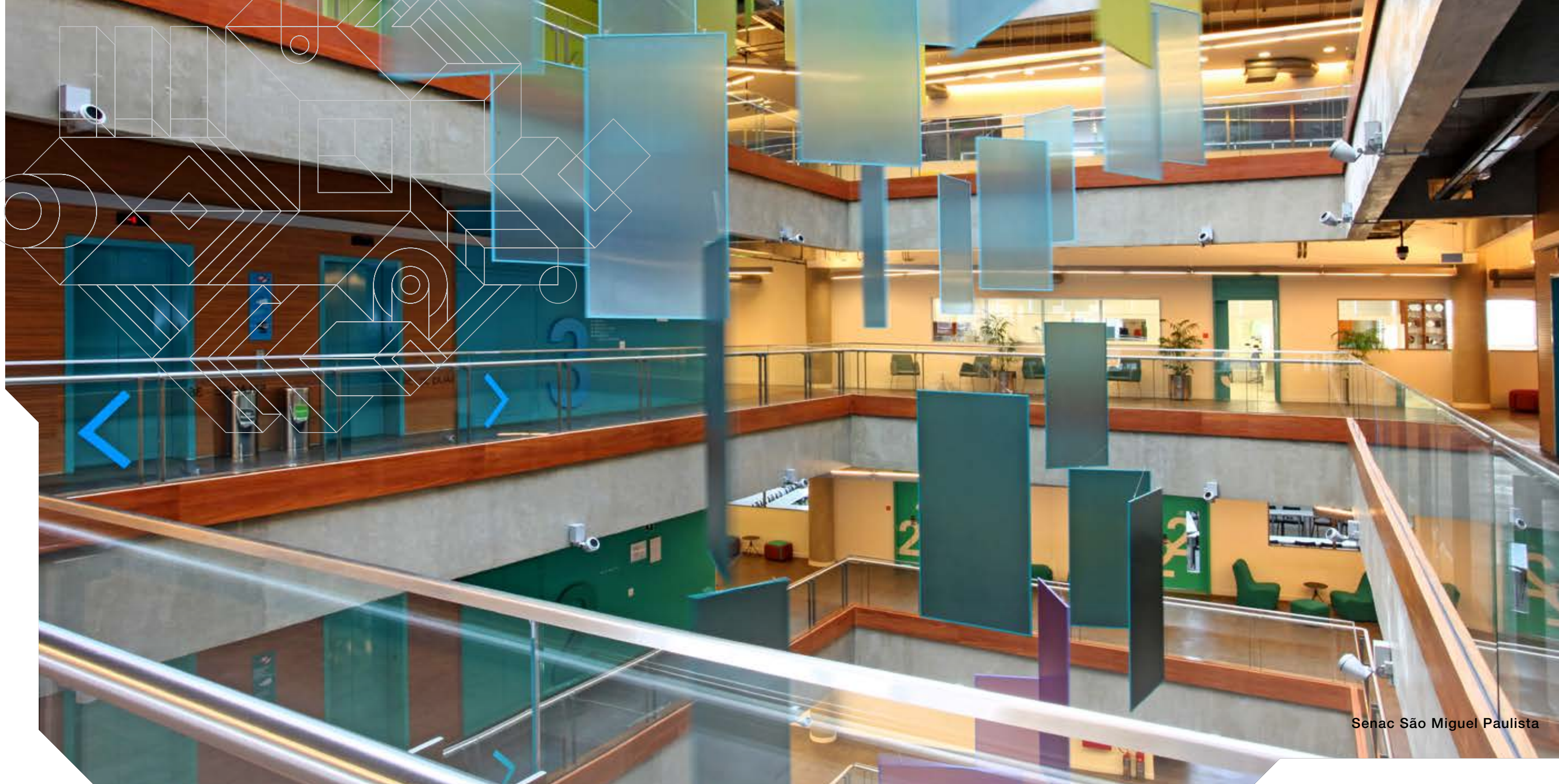
Senac São Miguel Paulista