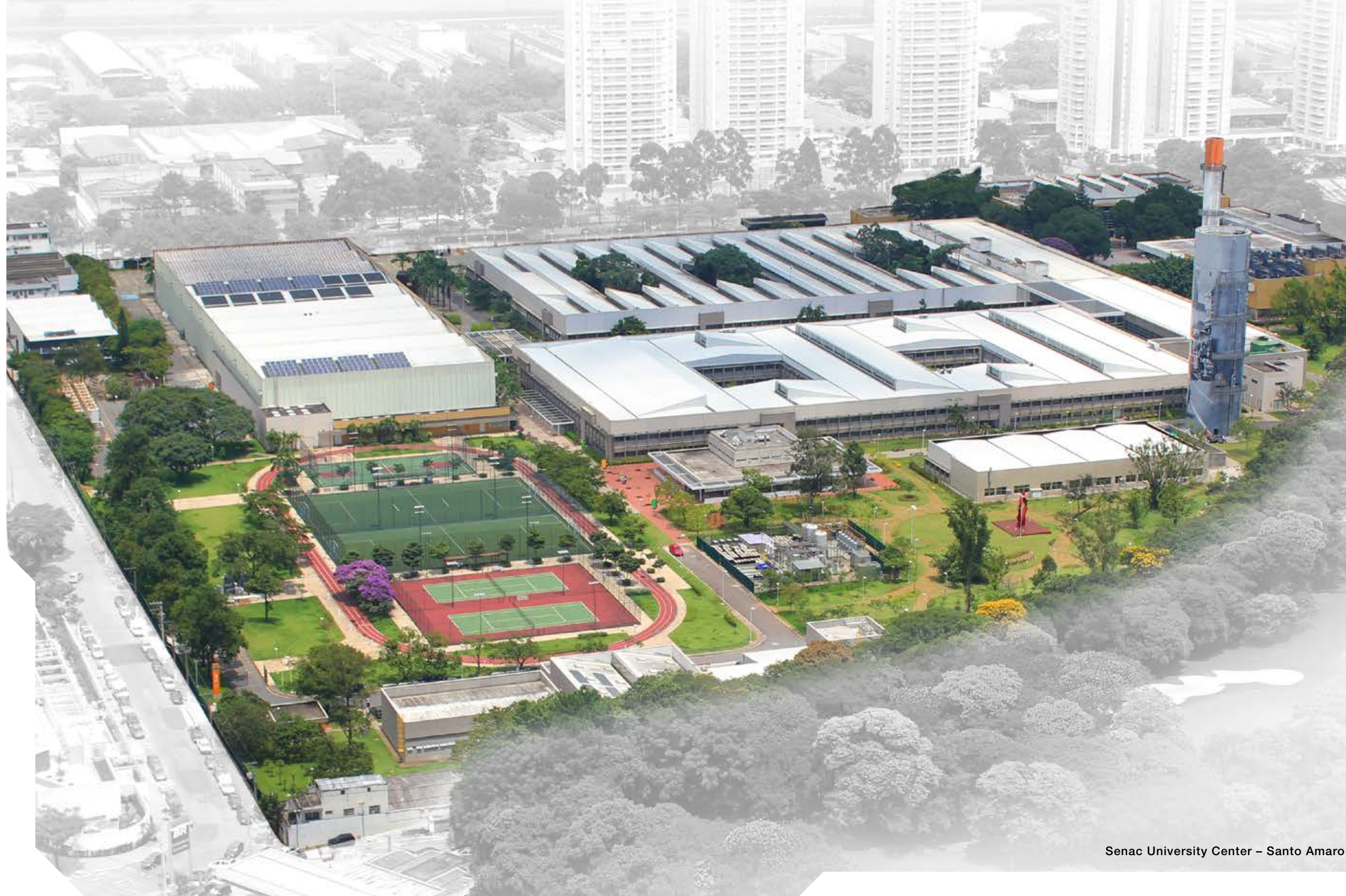
Senac University Center – Santo Amaro

Learn more about Senac São Paulo, its history, areas of activity and programs at Senac Portal. Visit: www.sp.senac.br