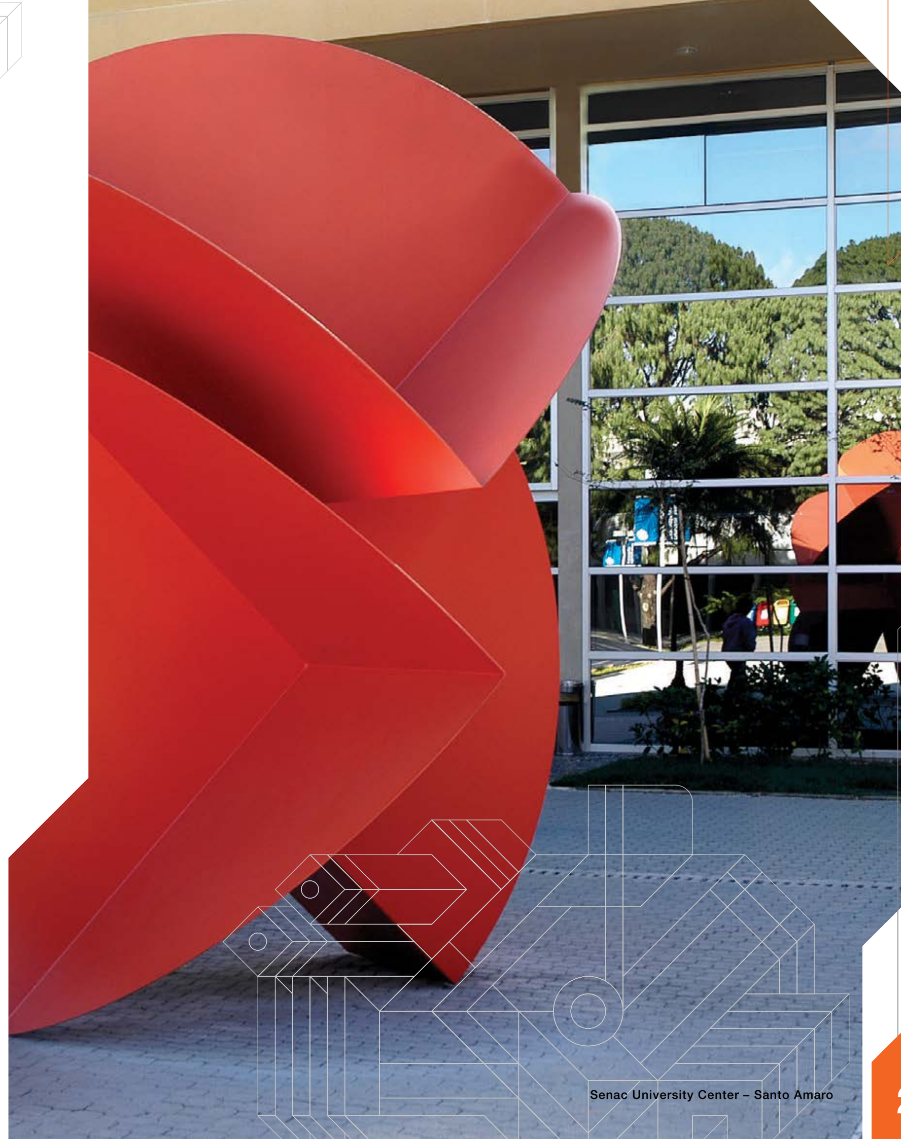
Senac University Center – Santo Amaro

Opened in 2004, it occupies an area of 154,000 square meters with facilities distributed in a horizontal plan consisting of two academic buildings, with 102 classrooms, theme laboratories, innovation centers, library, collection of materials and documents from the fashion industry, gastronomic center, convention center, sports center, gym, food courts and services. It offers approximately 40 classroom-based and distance undergraduate programs.