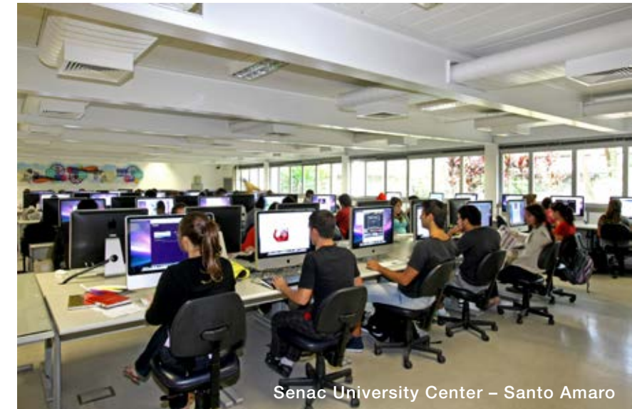
Senac University Center – Santo Amaro

Senac University Center comprises Santo Amaro (São Paulo), Águas de São Pedro and Campos do Jordão (São Paulo countryside) campuses. They offer classroom-based and distance undergraduate programs (Bachelor's Degree, technology and teaching license), specialization programs, and continuing education.