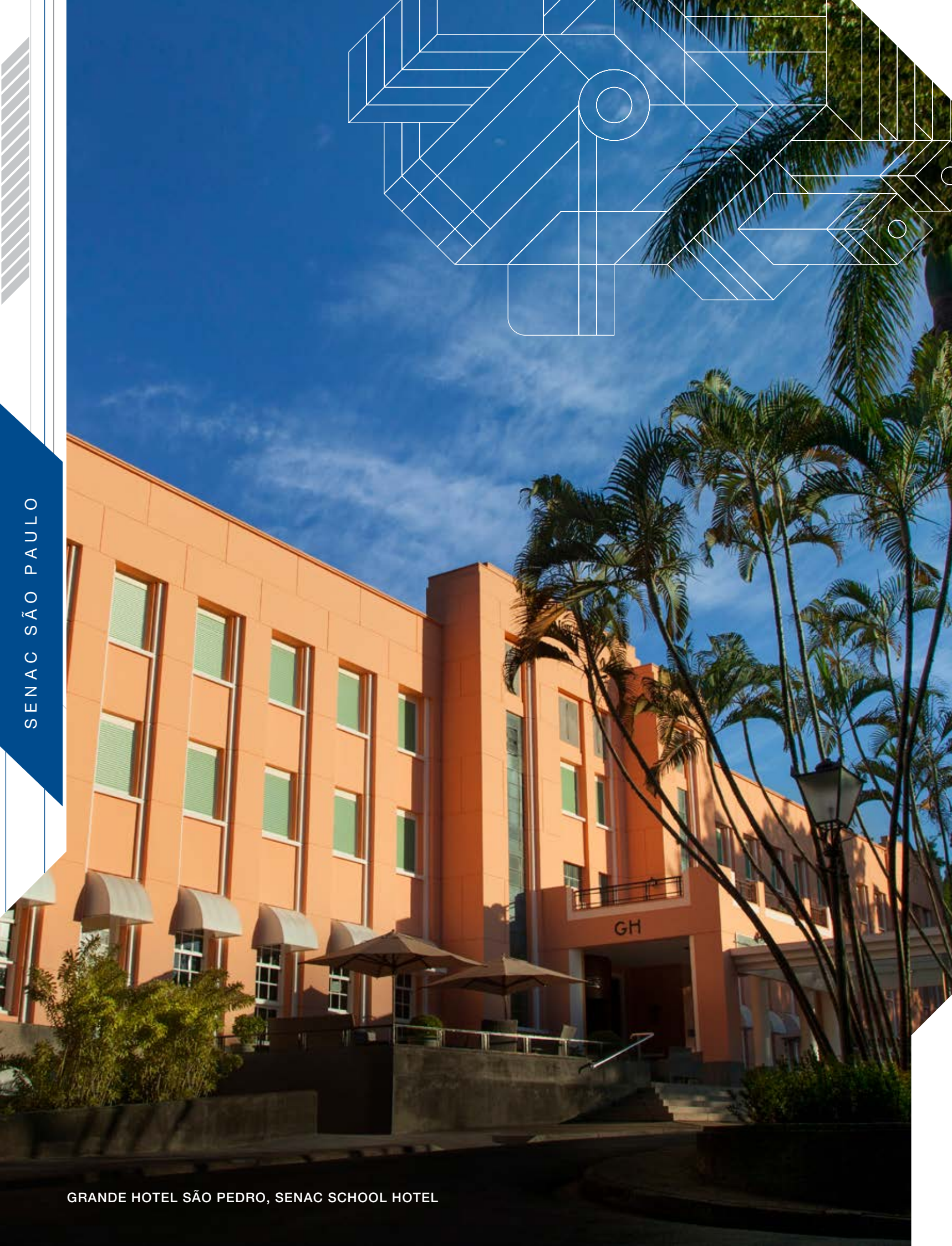
GRANDE HOTEL SÃO PEDRO, SENAC SCHOOL HOTEL